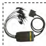
Logic Analyzer Module