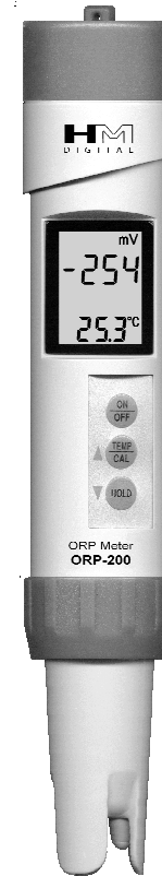
ORP-200 ORP / TEMP METER