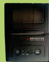
Mirco Printer for HARTIP3000/HARTIP2000