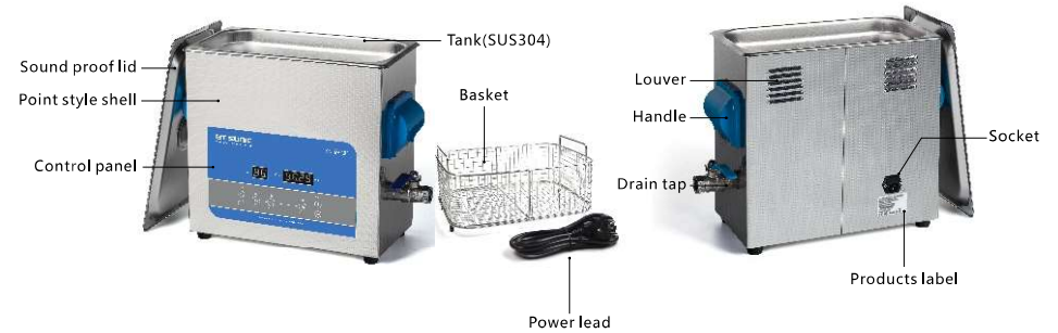
Figure of control panel :