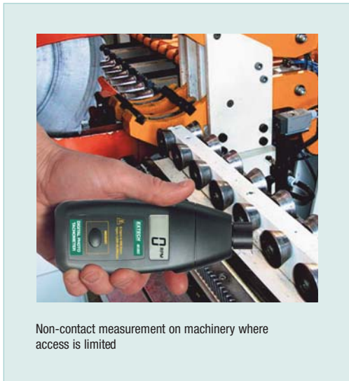
Non-contact measurement on machinery where access is limited