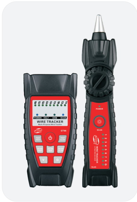
Standard:Q/GMY 020-2015 Version:GT66-EN-01

existence and positive or negative characteristic of the voltage. This function only requires the transmitter. Press the V button; get into the cable voltage test mode, VOLT light turns on. Plug the alligator clip into the RJ11 socket of the transmitter, and clip the Red & Black clip to the measuring wiring, or plug the RJ11 telephone line directly into the RJ11 interface. The OHM or SCAN light would light, if there is a phone line voltage. When the SCAN light lights, the red alligator clip connects the anode, on the other hand, it is cathode, when the OHM light lights. This product is designed for weak current, such as phone line, do NOT use for strong current, in case of electric shock and damage of the equipment.