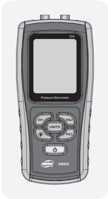
Version : GM505-EN-01